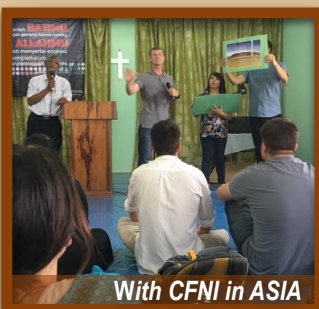
With CFNI in ASIA